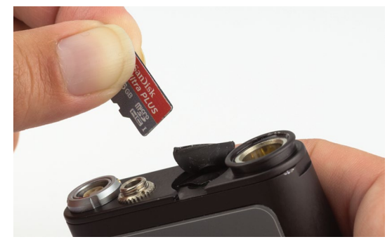
The audio is recorded on a micro SD card (HC type).